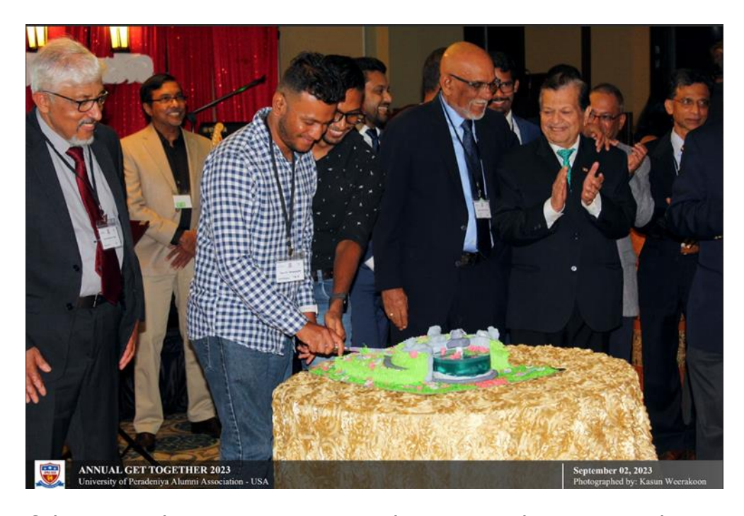
Cake cutting by two most senior and junior members in attendance.