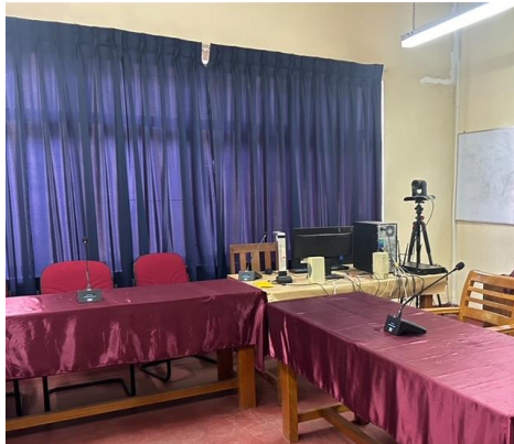
Laboratory and audio-visual equipment donated to the Department of Physics.